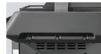
Integrated, hidden tool hooks