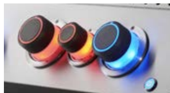
SafetyGlow™ control knobs