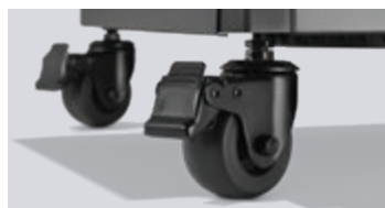
Caster wheels with 2 point leveling system