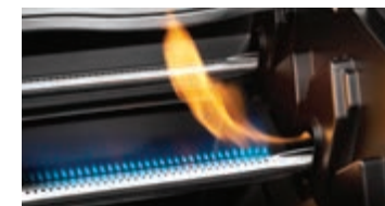
Instant, battery free JETFIRE™ 2.0 ignition