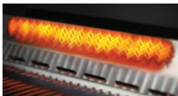
Infrared rear rotisserie burner with included heavy duty rotisserie kit