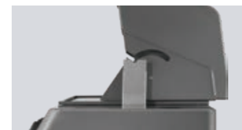
LIFT EASE™ roll-top convection lid