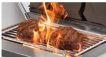
Infrared SIZZLE ZONE® side burner