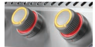
SmartGlow™ technology knobs