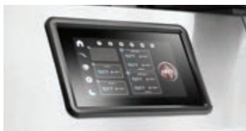
Smart mode with intelligent gas automation