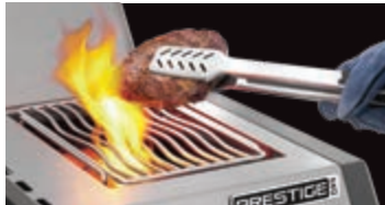
Infrared SIZZLE ZONE® side burner