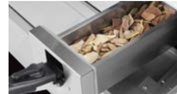
Built-in electric smoker box