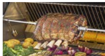
Infrared rear rotisserie burner with included high capacity rotisserie kit