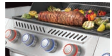
Guided LED lighting