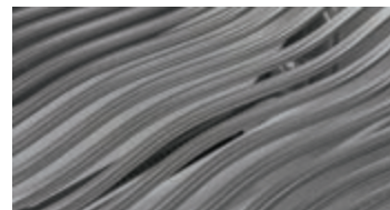
9.5mm Stainless Steel Iconic WAVE™ cooking grids