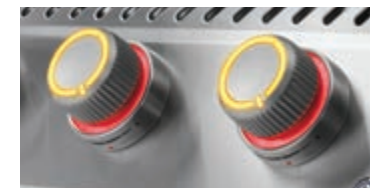
SmartGlow™ technology knobs