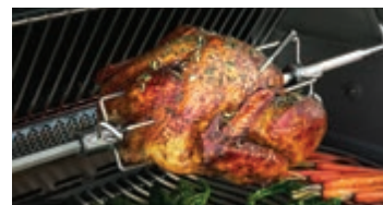
Infrared rear rotisserie burner with included heavy duty rotisserie kit