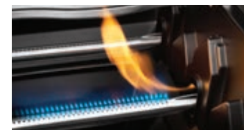
JETFIRE™ 2.0 ignition