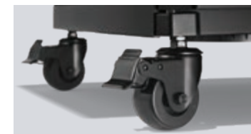
Caster wheels with 2 point leveling system