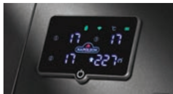
Wi-Fi and Bluetooth® connectivity, LCD display