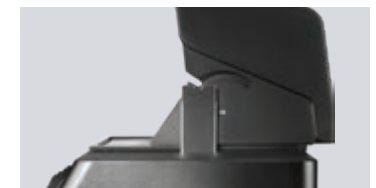
LIFT EASE™ roll-top convection lid