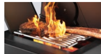
Infrared SIZZLE ZONE® side burner