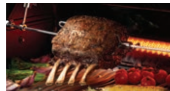
Infrared rear rotisserie burner with included heavy duty rotisserie kit