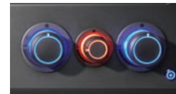
SafetyGlow™ control knobs