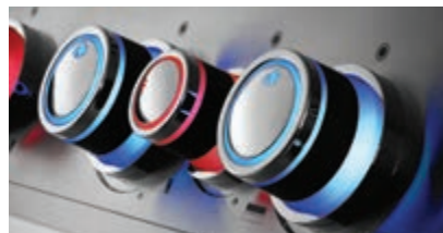
NIGHT LIGHT™ control knobs with SafetyGlow™