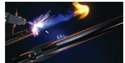
Instant JETFIRE™ ignition