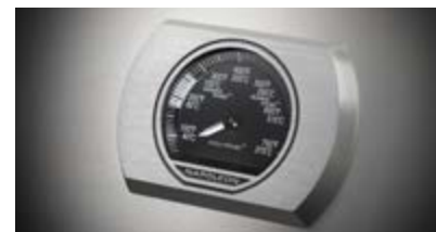
ACCU-PROBE™ temperature gauge