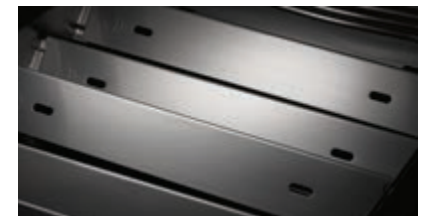
Dual-level stainless steel sear plates