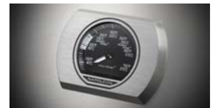
ACCU-PROBE™ temperature gauge