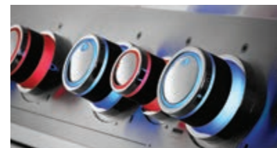
SafetyGlow™ control knobs