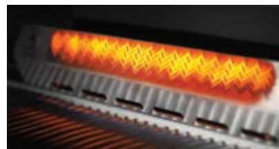
Rear infrared rotisserie burner